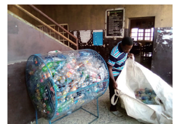
Plastic bottles collected at an elementary school

Going forward, Sumitomo Chemical will continue working to improve the educational environment as an important social contribution activity and actively promote initiatives aimed at resolving social issues on a global scale.