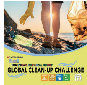
The symbol image for Global Clean-up Challenge

In fiscal 2022, the Group launched new clean-up initiatives called “Global Clean-up Challenge” with the aim of fostering unity as a Group. Going forward, we will continue working to address the plastic waste problem.