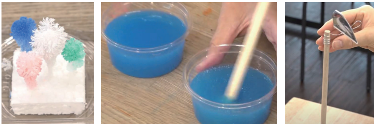
Screenshots from the videos

At Ehime Works, so that children who could not go outside due to the pandemic could still have fun at home, in continuation from the previous year, videos were produced in collaboration with Ehime Works veteran employees entitled, “Science Experiments and Crafts You Can Do at Home!”*2 (Vol. 7–9). They have been made available on YouTube for anyone to watch at their convenience.