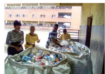
Sorting out collected plastic bottles